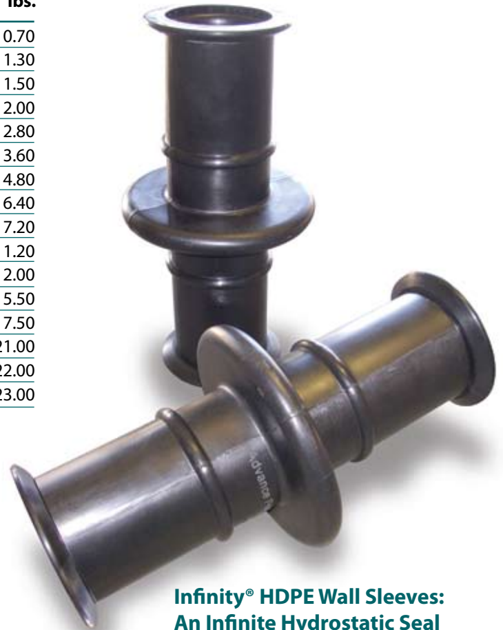
Infinity® HDPE Wall Sleeves: An Infinite Hydrostatic Seal