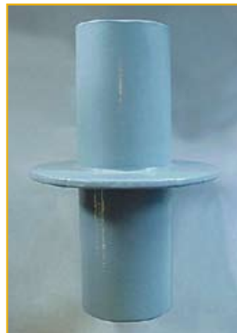
Figure 3: Gal-vo-plast® Wall Sleeve after 500 hours of exposure