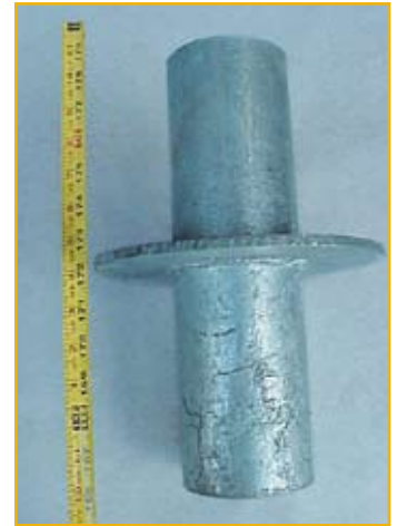
Figure 2: Galvanized Wall Sleeve submitted for testing