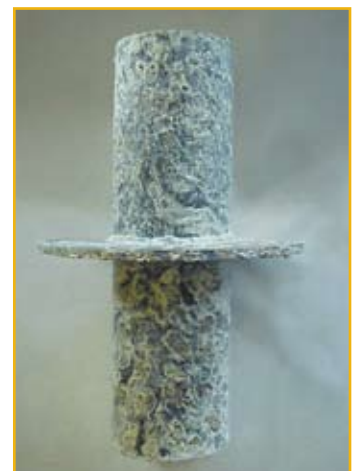
Figure 4: Galvanized Wall Sleeve after 500 hours of exposure