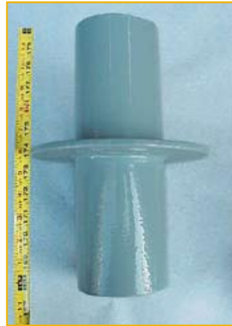
Figure 1: Gal-vo-plast® Wall Sleeve submitted for testing

The visual examination revealed considerable oxidation of the galvanized coating on all exposed surfaces. Figure 4 shows the galvanized wall sleeve covered with white zinc oxide.