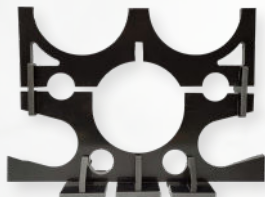
Single or multi-piece designs