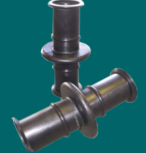
Infinity® HDPE Wall Sleeves