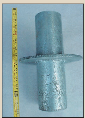
Figure 2: Galvanized Wall Sleeve submitted for testing