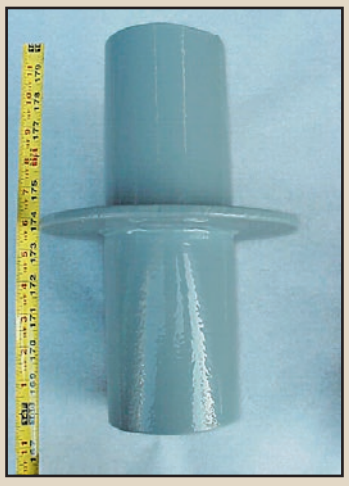
Figure 1: Gal-vo-plast® Wall Sleeve submitted for testing