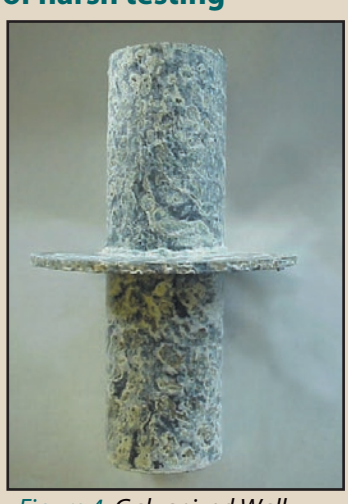
Figure 4: Galvanized Wall Sleeve after 500 hours of exposure