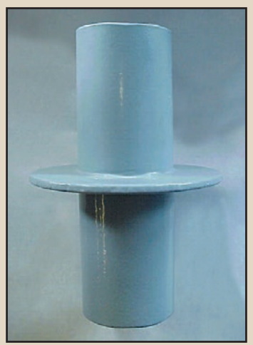
Figure 3: Gal-vo-plast* Wall Sleeve after 500 hours of exposure