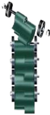
Oil Resistant Nitrile Green