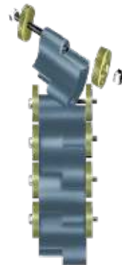
Extreme Temp Silicone Grey