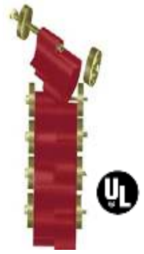
3 hr fire rating proprietary Silicone Red

***HAVING TROUBLE SIZING INNERLYNX®? USE OUR ONLINE CALCULATOR AVAILABLE AT WWW.APSONLINE.COM/INNERLYNX ***