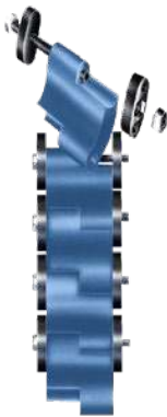
Low Durometer EPDM Blue