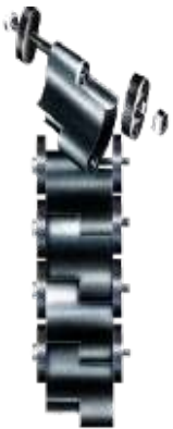
Standard EPDM Black